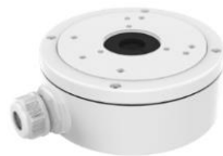
DS-1280ZJ-S Junction Box